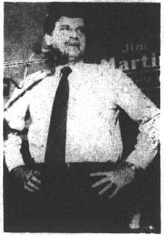
Impressed Republican gubernatorial candidate Jim Martin smiles as Democrats attending his July 24 Fayetteville rally raise their hands; Martin asked Republicans to applaud the Democrats, saying it took courage to reject party pressure.