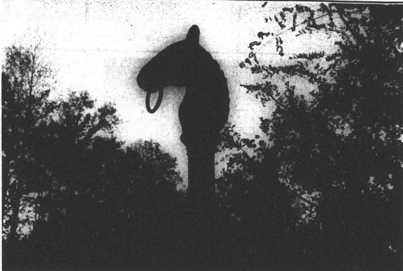
Steadfast No matter what happens, this stallion will never move. It is an old hitching post. Hardly anyone uses it anymore, and there is no telling how long it stood in its present position. But it still stands there on its metal pole--stationary--steadfast.