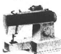
Free-Arm Machine Model 5528