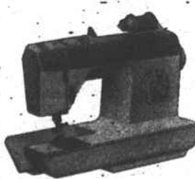
Flip & Sew Machine Model 290 19 built-in stitches • Push-button bobbin winds thread directly from needle • Built-in buttonholer