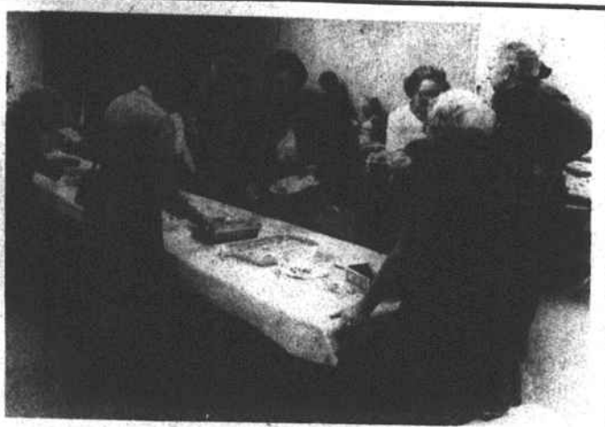
Tasting Hoke County Extension Homemakers Association held a Tasting Party and Christmas Display on Thursday. Over 120 people sampled different dishes for 10¢ a taste. They also received a recipe for the dish. Various Christmas craft and gift ideas were displayed and some items were sold. Door prizes were given each hour. Some of the dishes for tasting were mounds, strawberry salad, chicken casserole, buttermilk pie, ham and broccoli casserole, dump cake, reception salad, sausage casserole, squash casserole, broccoli salad, dried beef casserole, and pound cake. Copies of these recipes are available at the Agricultural Extension Service Office.