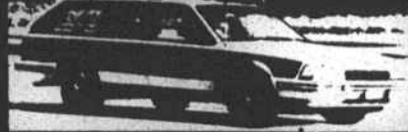
1985 Buick Century Station Wagon