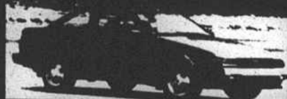
1985 Toyota Corolla GTS Coupe Over 100 H.P. Gas Engine