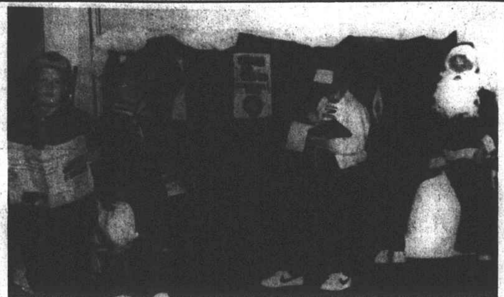
Brought down the house

As of Monday, nothing had been found missing, he added.