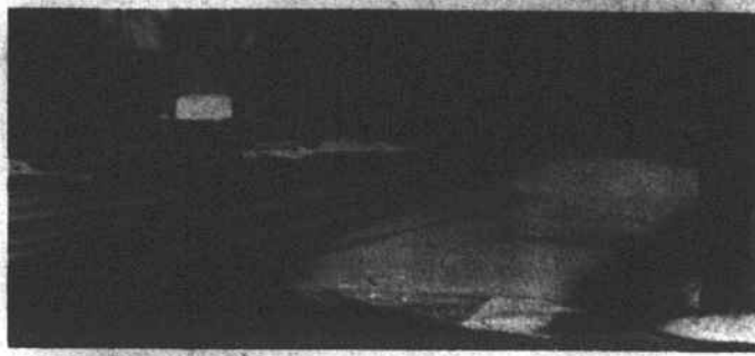
Little dusting Snow covered the streets of Raeford during the early spring, but most of the weather in 1984 for Hoke County was mild.

An interim budget was passed by the county commission to meet a June 30 deadline.