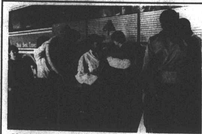
Unloading Members of the Hoke High band unload equipment in preparation for Saturday's inaugural parade in Raleigh.

For more information, write to the admissions office, School of Social Work, 223 E. Franklin St. 150A, UNC-CH, Chapel Hill, N.C. 27514; or call 962-1225.