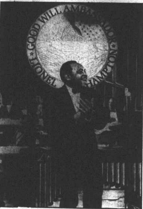
AT PEMBROKE - The Performing Arts Center of Pembroke State University has announced Lionel Hampton and his 15 piece orchestra will open THE SEASON on Thursday, October 3, with an evening of swing, jazz and blues. Hampton has been a vital part of the jazz vibraharp. His musical contributions to the world have become legendary. THE SEASON subscribers can receive a 10% discount if tickets are purchased before June 1. Tickets are $17.50 for individuals, $15 for Senior Citizens and $85 for families. For more information or to order a subscription call the Performing Arts Center at 521-0778.

April 3-7 GGO TOURNEY - Burlington Industries will be the major sponsor of the 1985 Greater Greensboro Open (GGO) Golf Tournament, to be held April 3-7. Burlington's involvement includes sponsorship of the Pro-Am event on April 3 and television coverage on ESPN cable network. In addition to the national television coverage, more than 140,000 people attend the tournament in person. The GGO is now in its 48th year.