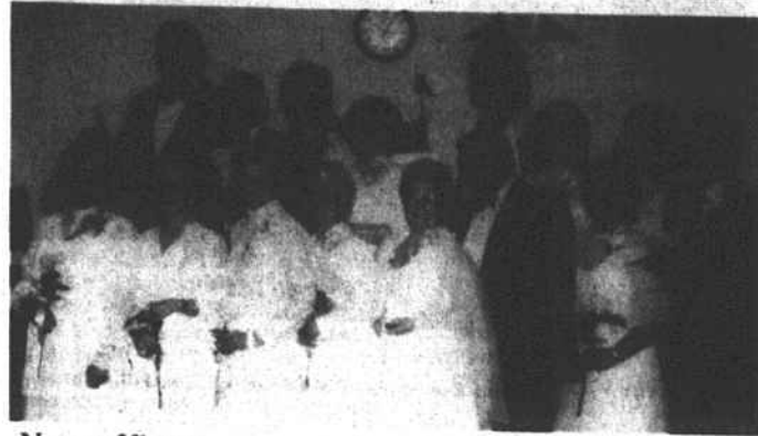
These new officers were recently installed by the Eastern Star.