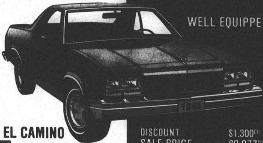
1985 EL CAMINO (4050000)