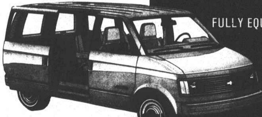
1985 ASTRO CONVERSION VAN (40318720)

DISCOUNT SALE PRICE $1,000.00 $9,977.00*