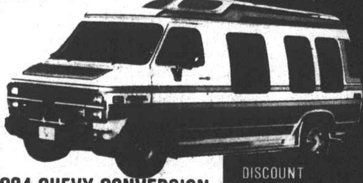
1984 CHEVY CONVERSION VAN (402704)

DISCOUNT SALE PRICE $2,000.00 $15,778.00*