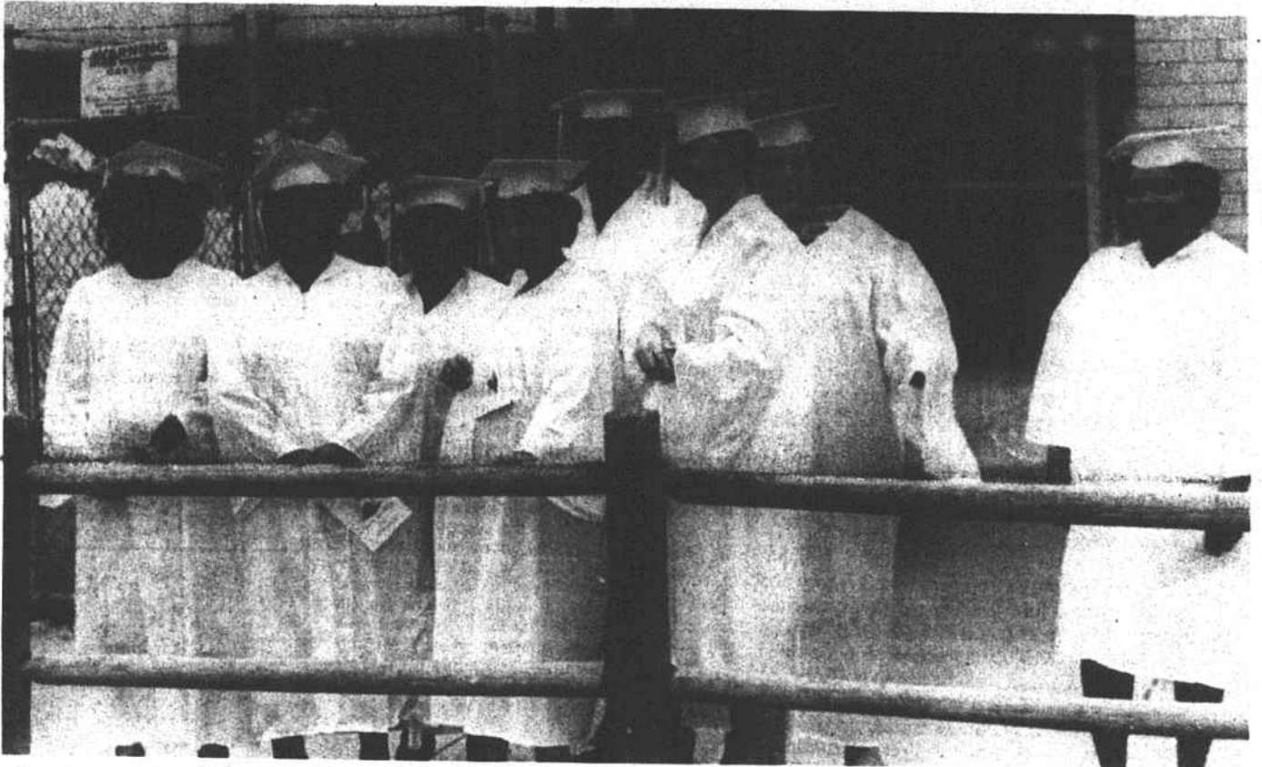
Members of the adult graduating class line up prior to the exercises.