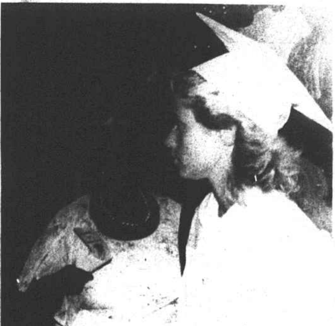
Friday night was a special time for graduates and for those who attended the exercises.