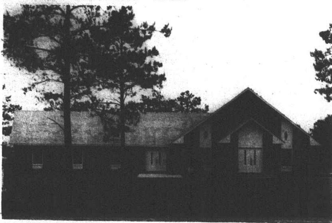
Supporting the community Shady Grove Missionary Baptist Church has been supporting the community for 67 years.