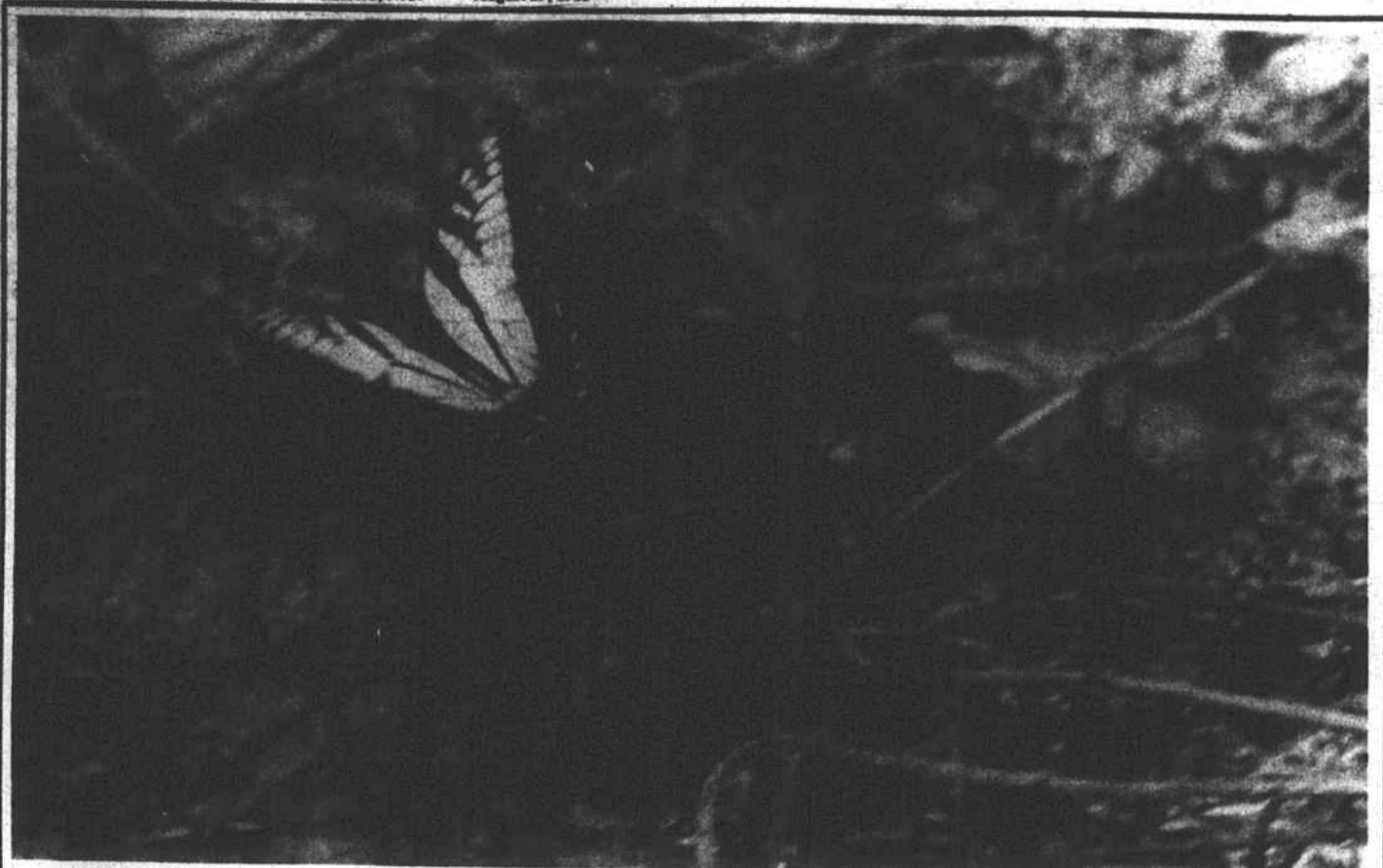
Winging it This butterfly cruises over the Hoke County landscape in search of a flower before he ends his days.