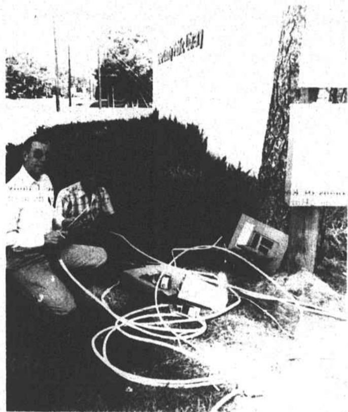
Helping hand CP&L electricians lend a helping hand to the festival by installing wiring to connect the stoves for the North Carolina Turkey Cooking Contest finals. CP&L crews also worked to insure that the proper power was available for Main Street vendors and musicians.