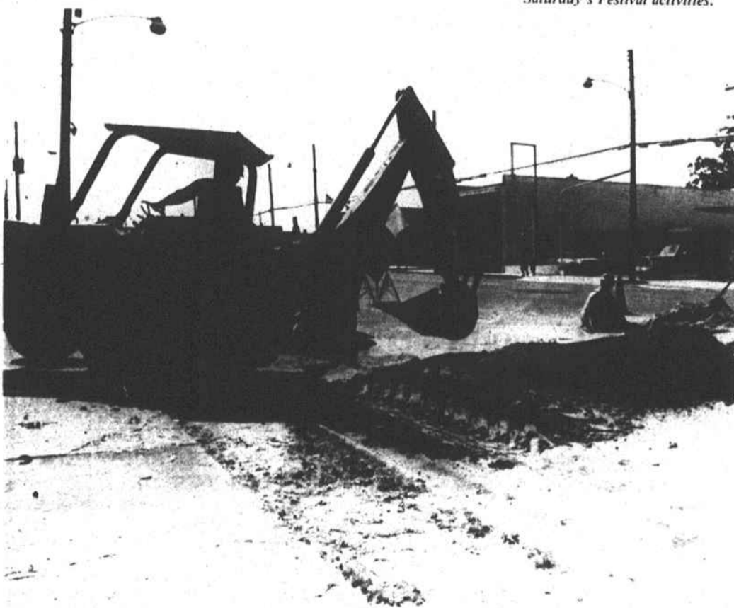
Finishing touches Raeford Municipal workmen put the finishing touches on a Main Street utilities repair which interrupted cleanup efforts for the festival. City workers have spent long hours cleaning streets, pulling

weeds and picking up trash in an effort to make Raeford shine for festival visitors. Municipal crews also face the problem of cleaning up after the event.