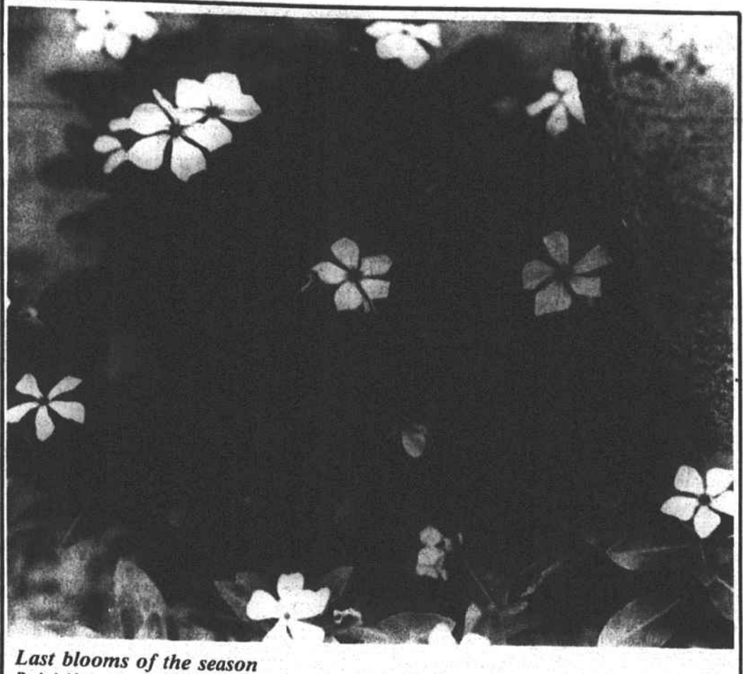
Periwinkles are dotting the Hoke County landscape these days with whitish-blue colors. The flowers are some of the last to be seen before winter.