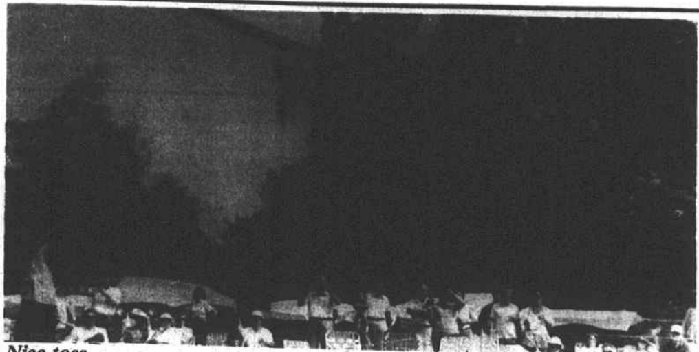
Nice toss This athlete appears to have a good toss of this pole during the caber tossing competition Saturday at the Highland Games in Red Springs. The sport takes balance, as well as strength to be a winner.