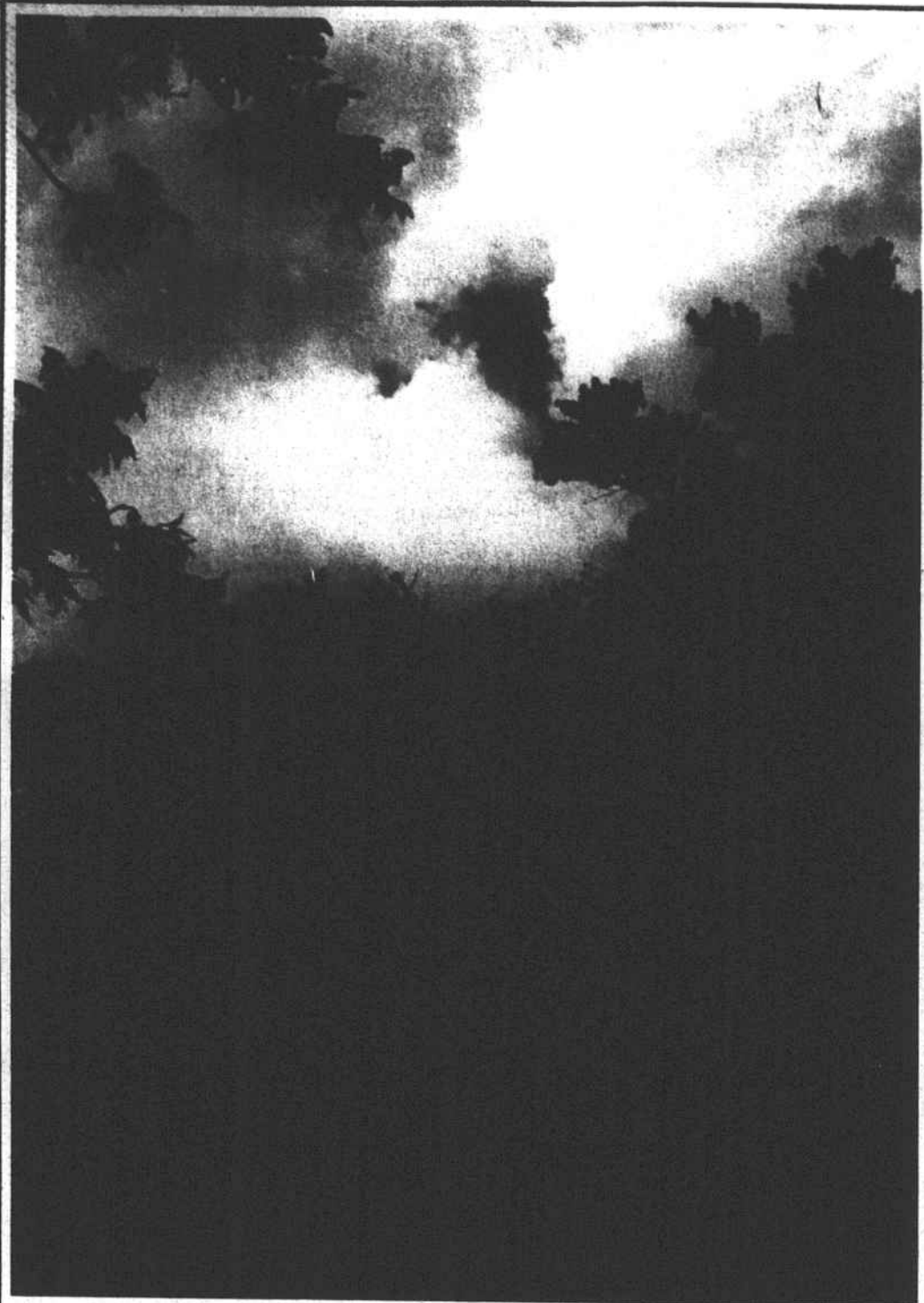
Changing weather Clouds darkened blue skies Sunday with bellowy forms as a cold front moved through Hoke County.