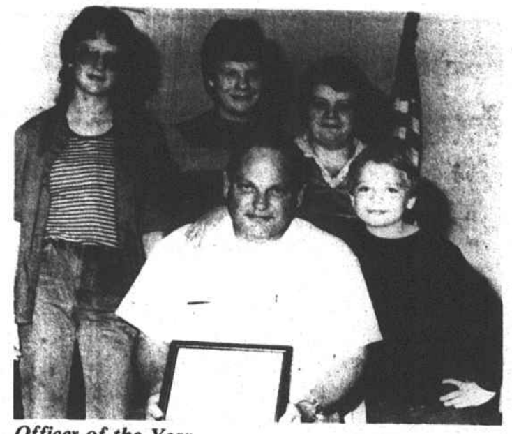
Officer of the Year

Everyone picked one or more projects to work on that interested