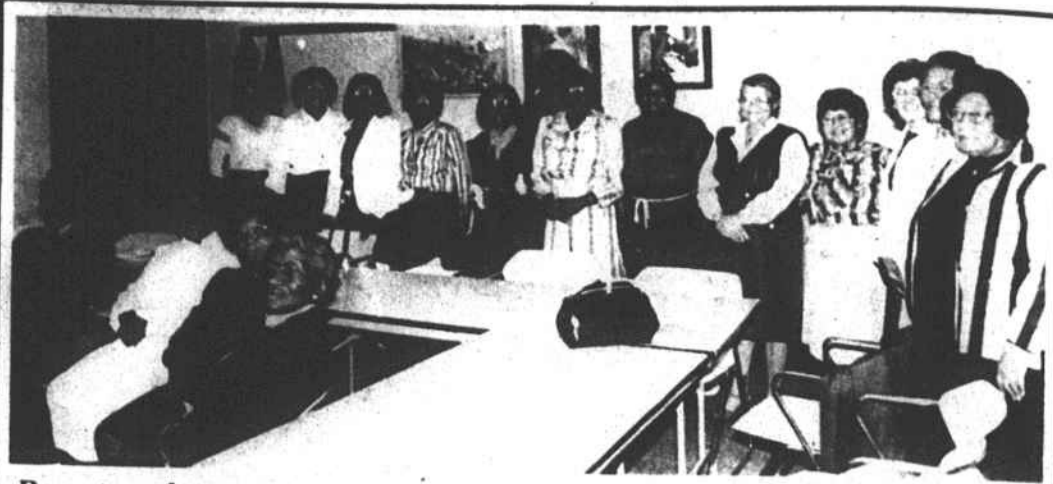
Recent graduates Students who attended the Home-Health Aid class at the Hoke County branch of Sandhills Community College take a break during graduation exercises recently. The 48-hour class was funded by the Job