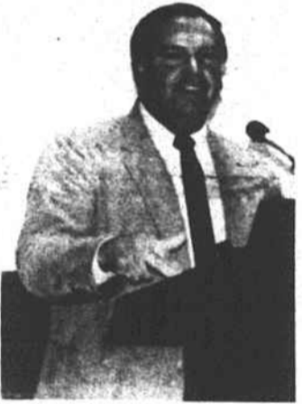
American Legion Former Yankee Bobby Richardson speaks to a banquet crowd at the Armory last week. The banquet was held to raise both money and support for a Hoke County American Legion baseball team.