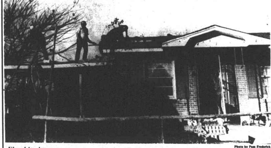
Fire hits home

Want to fight indoor air pollution in your home? Try household plants. Thousands of people may be poisoned in their homes each year by toxic substances such as carbon monoxide and nitrogen dioxide. Luckily, houseplants, particularly spider plants, are excellent air cleaners. So put some greenery in your home and breathe