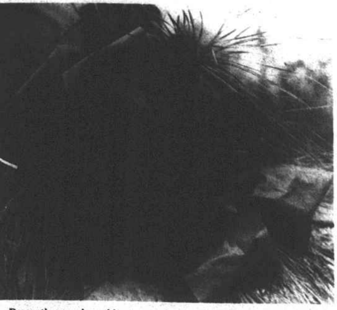
Decorations such as this one may be found throughout Raeford and Hoke County.