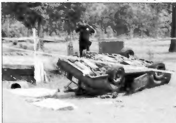
Scene of a Robeson County accident which killed two Hoke High students last week.