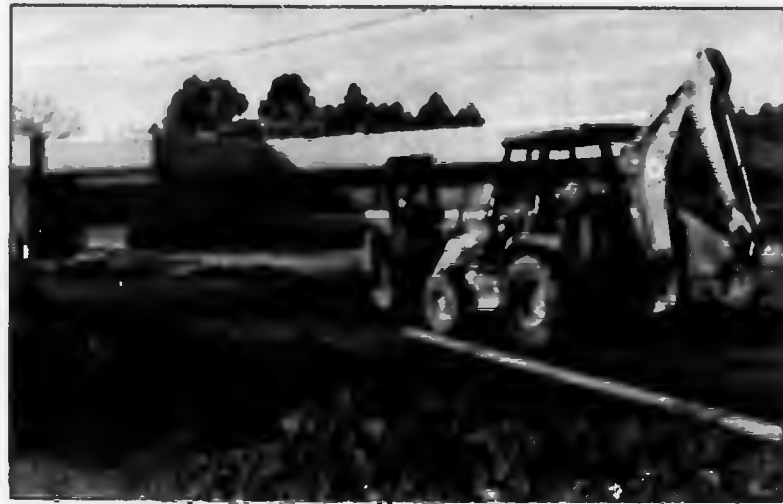
Cleanup work was underway Tuesday at the Hoke DSS building.