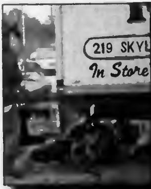
Two crashes kill two page 3A