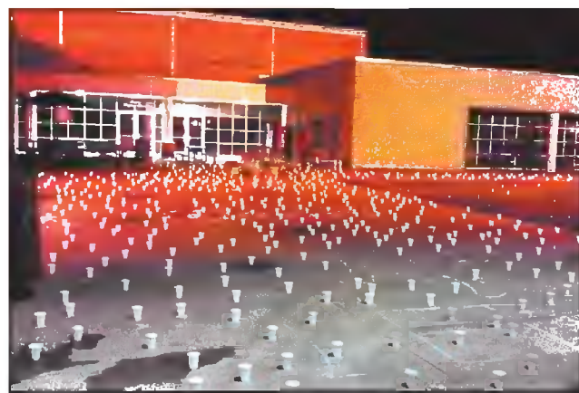
Maybe the best April Fool's joke to plague a Hoke school ever. The senior miscreants are "doing the time" now for it, having been "sentenced" to chores and in-school suspension.

It's a debate that surfaces from time to time, like (See OTHER STUFF, page 5A)