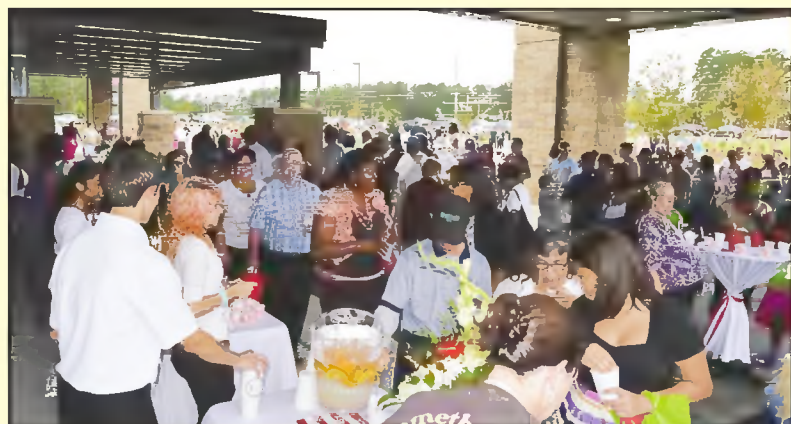
Hoke's first hospital opened to a big crowd.

With Hoke's first hospital opening, the 2013 was a big year for the county. Here's a look back at the year's news events: