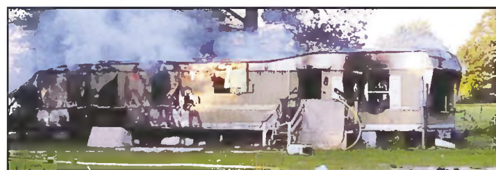
A fire Saturday in this mobile home on Duffie Road destroyed the house but did not injure anyone, officials said. South Antioch Fire Department was the primary responder on the scene assisted by the North Raeford and Stonewall fire departments. The Red Cross and family members provided assistance to the resident, who accidentally started the fire himself, according to reports.

Habitat for Humanity builds houses with donated labor, and sells them to deserving families with a no-interest mortgage that (See HABITAT, page 6A)