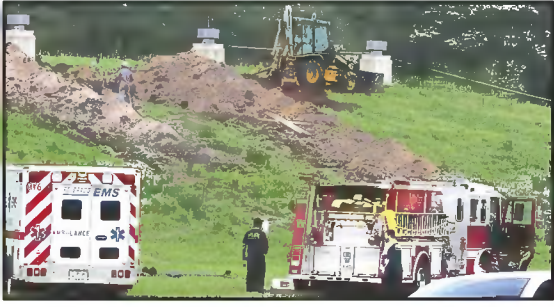
Rescuers at work.