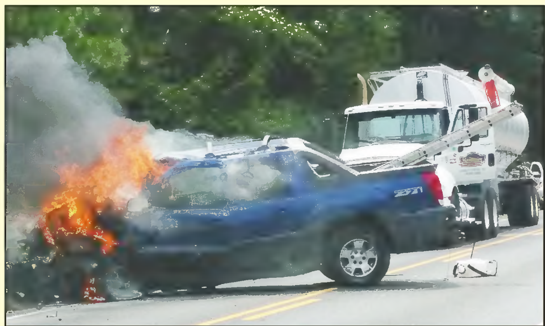
Left: Hoke sheriff's deputies attend to victims. Above, a truck burns after its driver escapes.