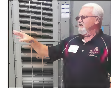
'Celebrate now, hard work begins Monday'