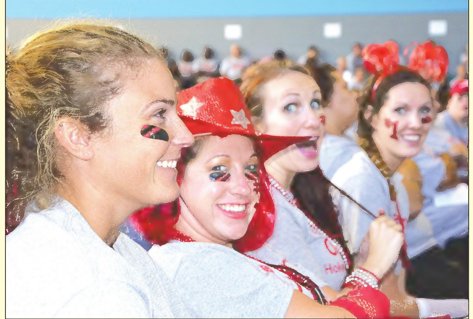
Hawk Eye Elementary School teachers and staff donned hats and face paint Friday to celebrate their school at the annual school system convocation at Sandy Grove Middle School.