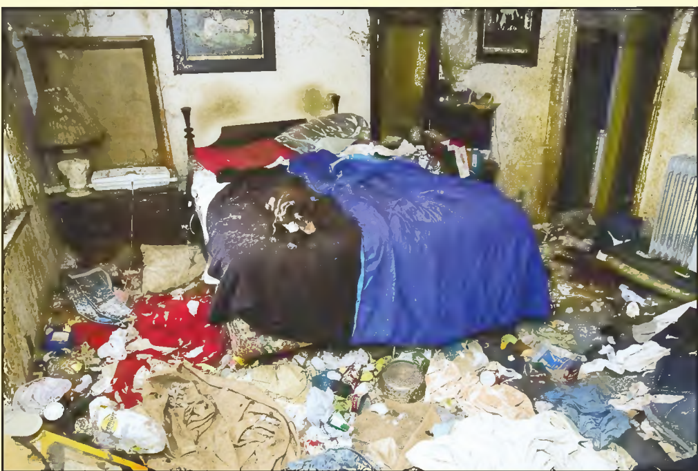
Living conditions for humans and animals at The Haven.