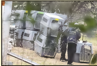
Preparing to move animals.