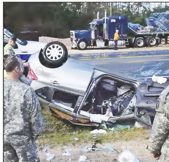
This Nissan Versa Note was knocked across N.C. 211 Monday when it turned into the path of the truck behind it.