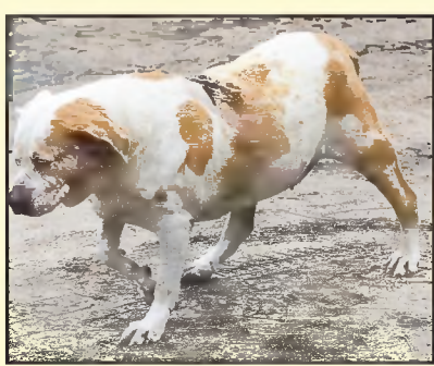
A sick dog.