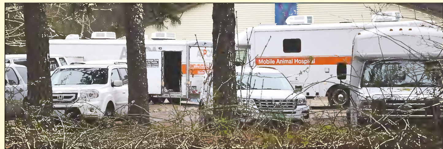
Mobile animal hospitals from the ASPCA line the grounds of The Haven last Wednesday.