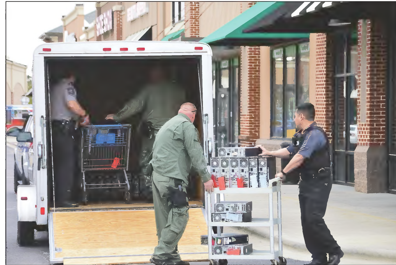
Deputies cart out computers allegedly used in illegal gambling at Club Pond Skill Internet Café Monday.

The Hoke County Sheriff's Office seized more than 240 computers allegedly used for illegal electronic gambling Monday afternoon in a simultaneous raid that shut down three alleged gambling parlors.