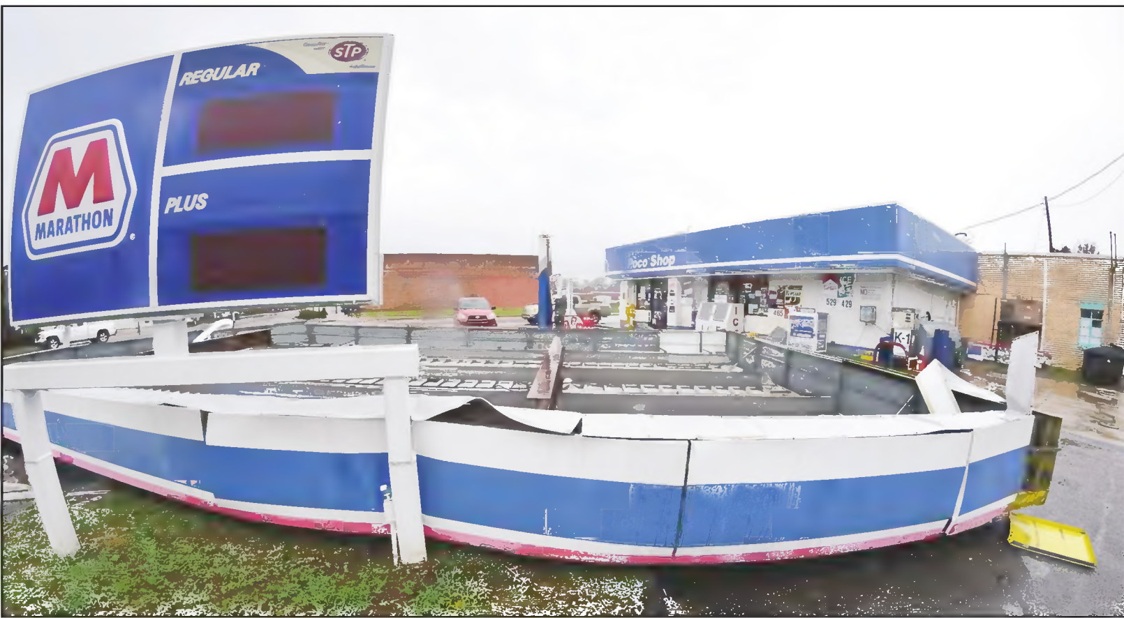
The canopy at the Poco Shop at Main and Central flipped from its perch during Florence's assault.