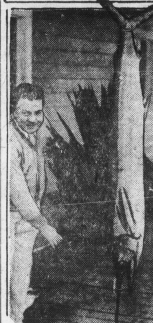
This sailfish, weighing forty-five pounds and more than seven feet long, was the first one caught by the President on his Florida trip.