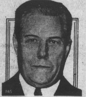
Myron C. Taylor, prominent New York banker, has been elected Chairman of the U. S. Steel Corporation, succeeding J. P. Morgan.