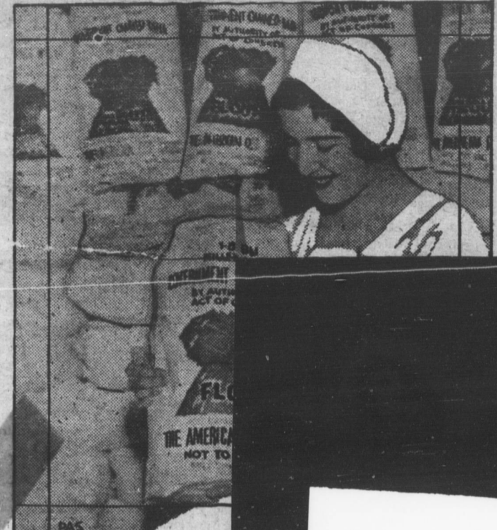
"Stabilization" wheat bought milled into flour and distributed. Surry county recently received 2,000 pounds were loaned the Elkin awaits a shipment of 6,500 pounds.