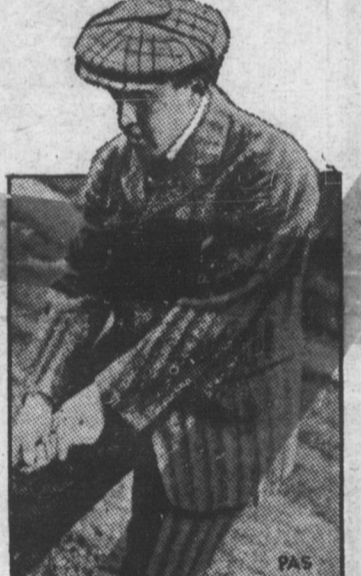
Eben B. Byers, wealthy manufacturer and famous sportsman, took "radium water" as a tonic and died of the effects. Hundreds of others are expected to die from the same "remedy."