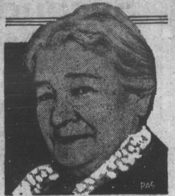
Frau Ernestine Schumann-Heink, 70-year-old Americanized singer, had to cancel her concert tour because of serious illness in St. Louis.