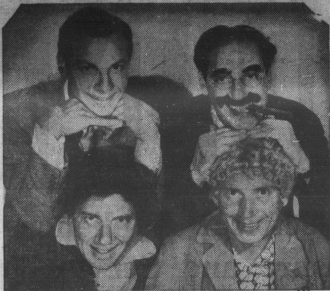
The 4 Marx Brothers in their latest and nuttiest picture, "Duck Soup," which will be one of the main features at the Lyric next week.

divide the books into chapters and verses, all of them unsatisfactory.