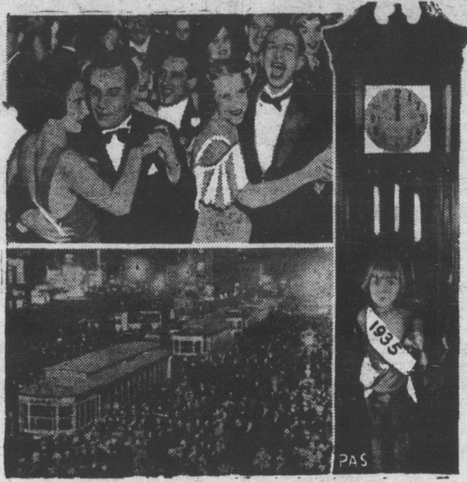
EVERYWHERE . . . Here he is folks, the first picture of young Mr. 1935, scheduled to make his appearance on the stroke of 12 midnight next Tuesday evening . . . He will be startled, as all young new years have been, at the turmoil and shouting, wishing all things good from him by all. Scenes: dancers gay and a New York New Year street crowd of yesteryear.