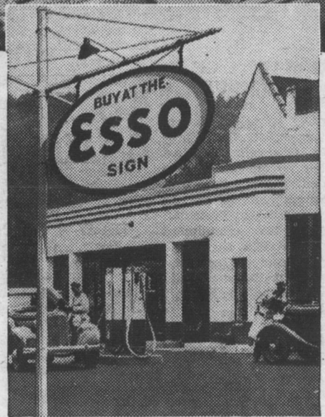
THE SIGN OF Happy Motoring!

Wherever you see an Esso sign... whether at a modest wayside filling station or an elaborate metropolitan servicenter... you can be sure of courteous treatment... helpful attention... and uniform high quality of everything you buy.