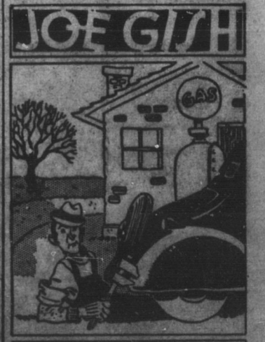
GETTING TO THE BOTTOM OF THINGS USUALLY LANDS A MAN ON TOP.