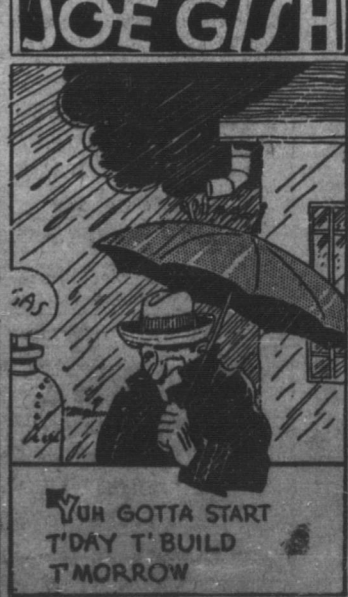
YOU GOTTA START T'DAY T'BUILD T'MORROW

Beginning this evening (Thursday), summer meetings of the club will be held at the local playground.