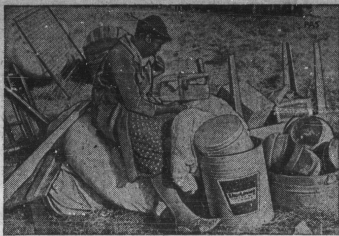
HAYTI, Mo. —This homeless sharecropper woman enjoys a bite along highway No. 61 near here. She is one member of the army of more than 1,000 Southeast Missouri sharecroppers, demonstrating against a low economic status, who have marched to the highways here.

of radium far down under the ocean than have yet been found on dry land.