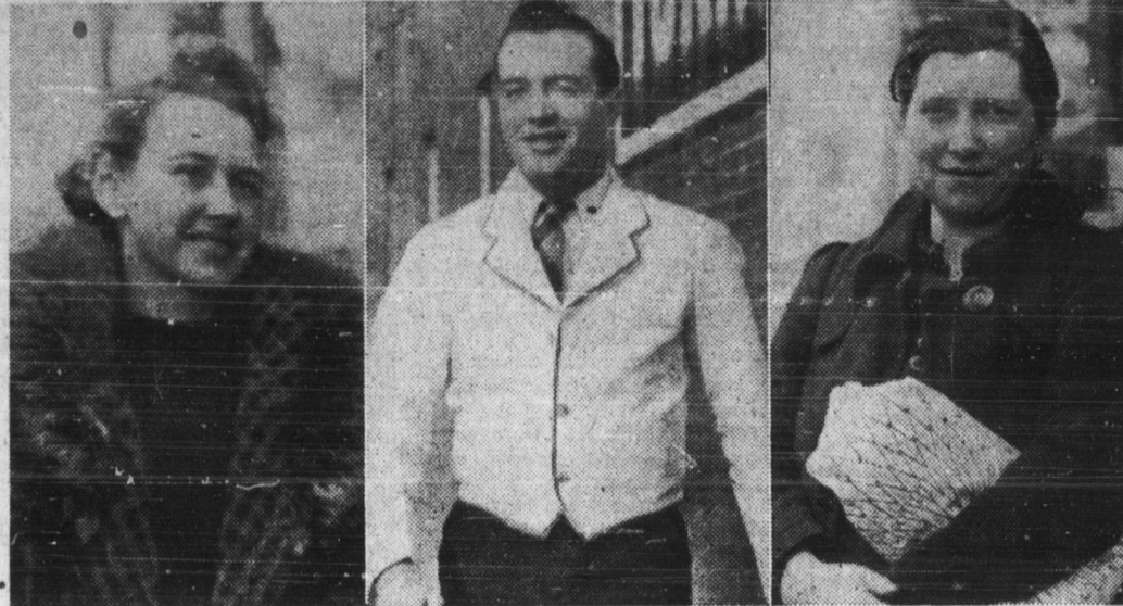
Step right up, ladies and gentlemen, and get your pictures taken. If they are published here it means two free tickets to the Lyric theatre for each and everyone. And as a result, the three pictured above have but to call in person at The Tribune office to receive their free tickets. They didn't exactly "step right up," but the Tribune cameraman got their pictures just the same.