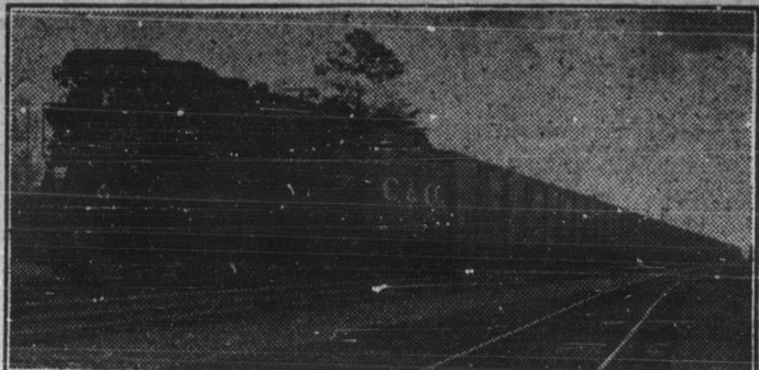
North Carolina dealers placed orders in January for thirty-two solid carloads of 1939 model General Electric refrigerators. Pictured above is the solid trainload of refrigerators enroute from factory to distributing points in North Carolina.

ritory, and all other interested parties are invited to attend the hearings and will be given an opportunity to be heard at any of the places herein specified.