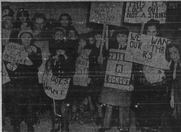
NEW YORK CITY . . . Children marching in a picket line outside the Board of Education at 500 Park Avenue to protest against their transfer from P. S. No. 97 to P. S. 89 in the Bronx, are seen taking time out for luncheon.