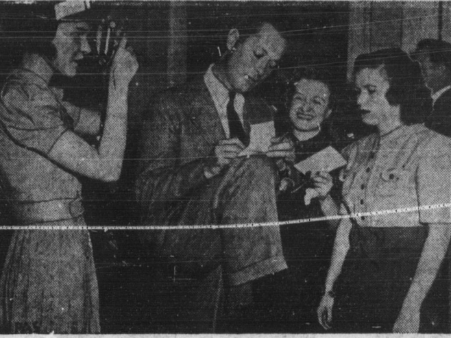
WASHINGTON, D. C. . . . Pretty girls from senatorial offices crowded the Capitol hearing room here to get a view of handsome Robert Montgomery, spokesman for the Screen Actors Guild, who testified before the Senate Interstate Commerce Subcommittee.