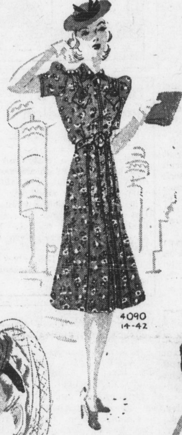
4090 14-42 Floral print Sportsack. Invisible slide fastener and gaily stitched pockets. Box pleats give moderate skirt swing. Aqua, Pottery Pink, Green Gold.