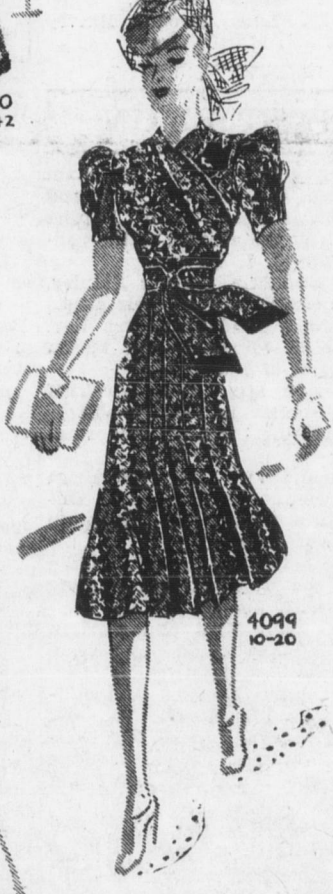
4099 10-20 Triple sheer in gay floral stripe. Soft bodice draped diagonally. Contrasting chiffon trims sash, echoed by kerchief. Navy, Wine and Black background with multicolor flowers.