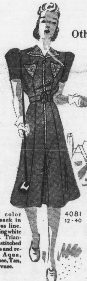
4081 12-40 Plain color Sportsack in princess line. Sparkling white zipper. Triangular stitched pockets and revers. Aqua, Tea Rose, Tan, Chartreuse.

The new, vibrant colors raise your spirits from "zero to ninety" and make you rejoice in Georgia's magic. Smart, young school girls, career girls and matrons will love these Georgians—literally "live in them" now—and way through Spring and Summer. They tub. They pack. They're color-fast.