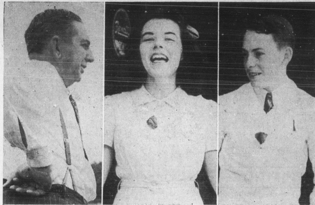
The Tribune photographer is liable to pop up anywhere when he is out taking free ticket photos. So if the three persons pictured above will call at The Tribune office they will be given two free tickets each, good for admission to either of Elkin's two modern theatres, the Lyric and Elk.