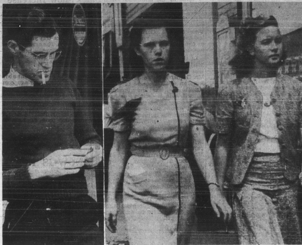
The young man and the two young ladies pictured above will be given two free tickets each to the Elk or Lyric theatres if they will call at The Tribune. Each week The Tribune photographer photographs three people on Elkin streets for free passes. Will you be next? Could be.