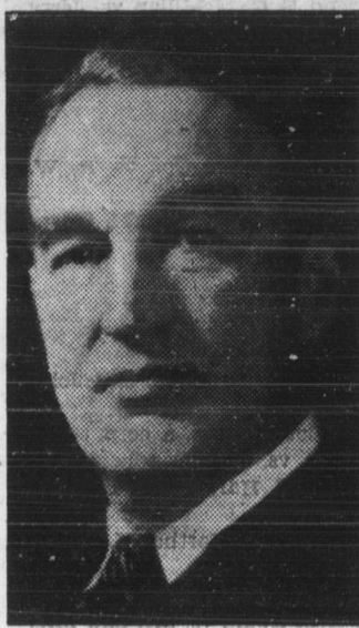
Pictured above is Senator James M. Mead, New York Democrat and an outstanding member of Congress who will address the annual convention of the North Carolina department of the American Legion in Raleigh Monday. The convention will be held from July 25 to 27. Ambassador Josephus Daniels is scheduled to present Senator Mead.